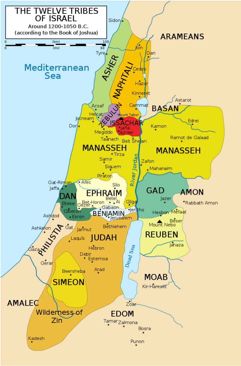
Map to help you visualize the descriptions of boundaries